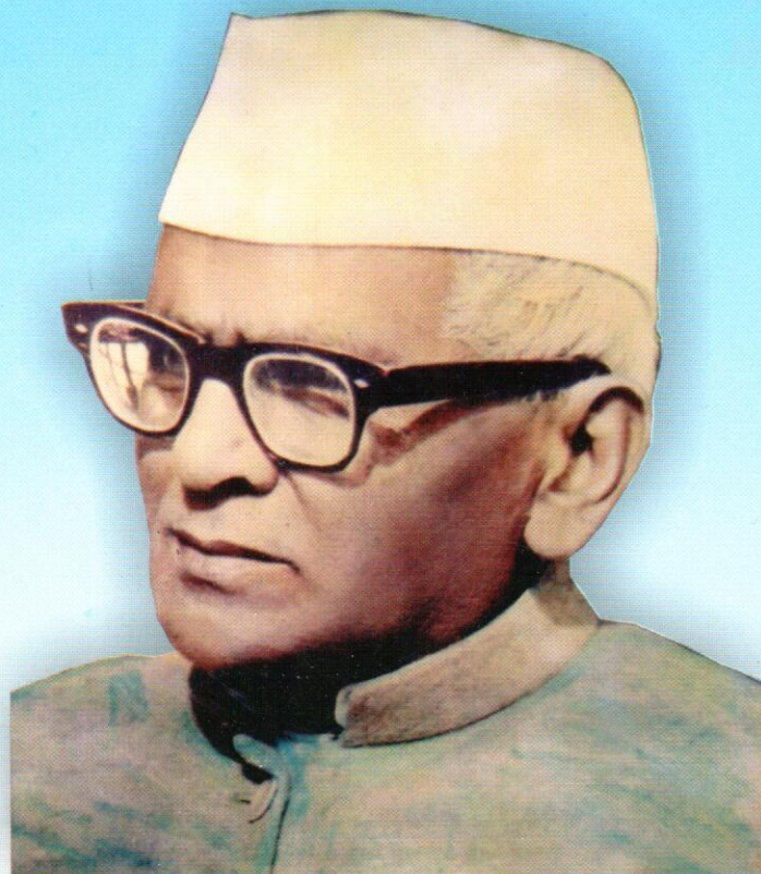
Late Sri Chandra Bhanu Gupta Ji