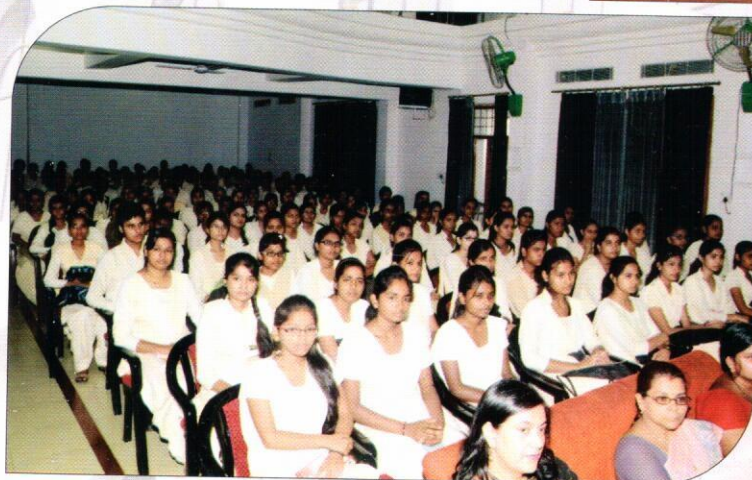
Students during the Orientation Programme-2015