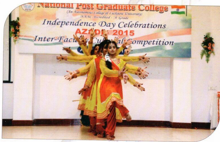
Students performing in Azadi-2015