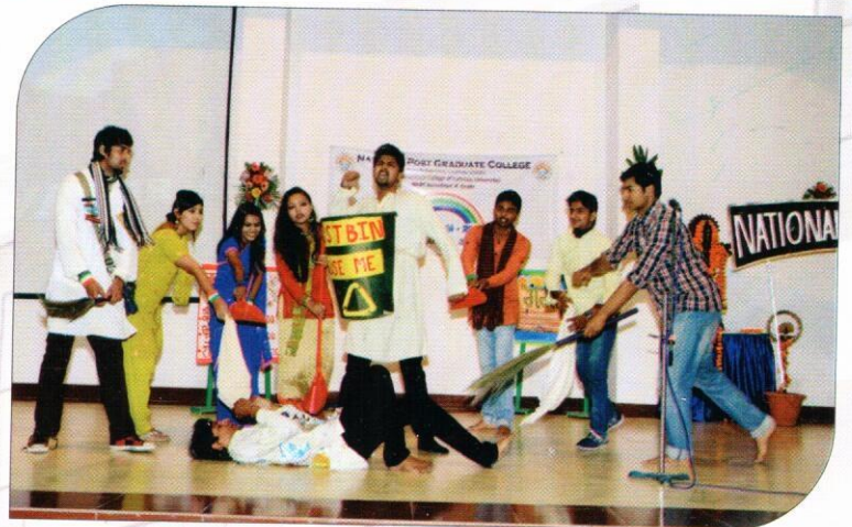
Social issues explored on Republic Day Celebration (Spectrum-2016)